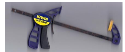
Example of a Ratchet Clamp About $2 at a HW store