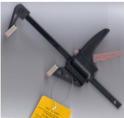
Another example of a RATCHET CLAMP

Use to hold the Digital Protractor to the flat side of the blade's tip.