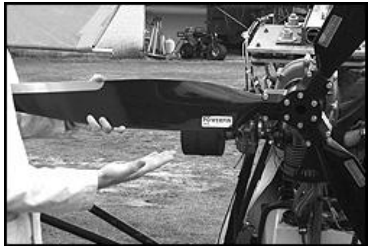
Figure 7: Work from the same position - relative to the craft and your hub, with every blade.

And when you're ready for the next blade, turn the propeller so that the next blade is again in this same position. In other words, bring the blades to you; you do NOT want to adjust your position for each blade.