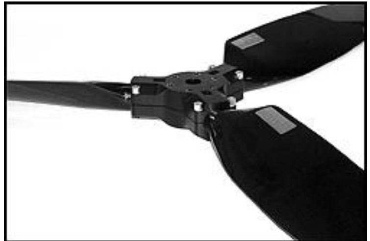
Figure 3: Place the top half of the hub on and insert the bolts.

3. Place the other half of the hub over the assembly. If using a dowel pin (whether imbedded 3/16" pins or a separate 1/4" dowel pin), the 1/4" hole or the pins should be viewable through the small square windows cut into the hub's front half. If this is the case, insert all of the outside retaining bolts – withOUT washers. Tighten them just to the point where you can pick up the assembly and it isn't so loose that the blades flop around.