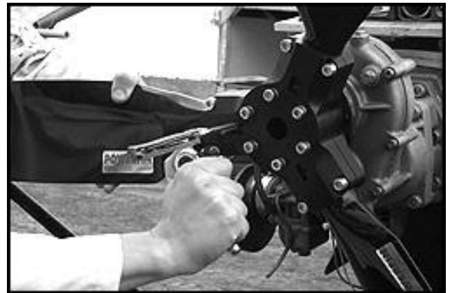
Figure 11: Holding the blade's 'turning' pressure against the feeler gauges, tighten the two outside bolts by going back and forth in small turns until the blade is snug, i.e., it does NOT turn easily.

Repeat steps 10 and 11 for each blade and then proceed to step 12.