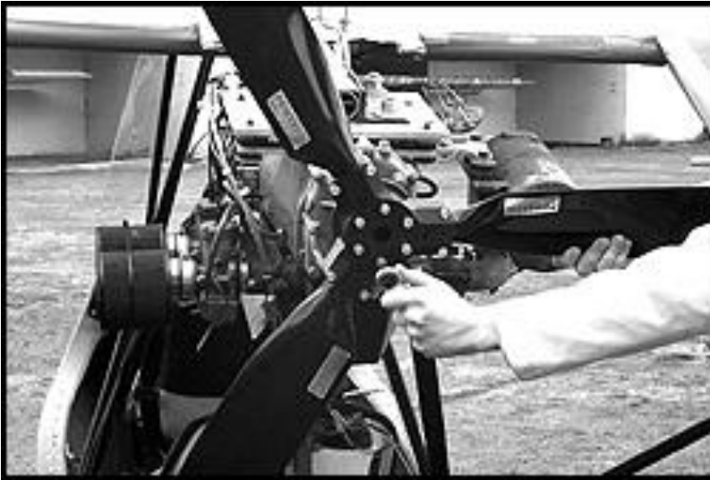
Figure 6: Lightly snug the center bolts (mounting plate bolts) But make sure the blades can still turn in the hub.

flat washer – no more. Make sure the blades still turn in the hub by hand, without too much effort. Loosen each bolt evenly in very small increments, if this is needed to turn a blade in the hub.