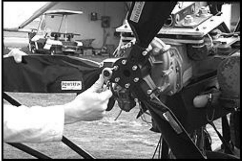
Figure 11: Evenly tighten the inside bolts fairly snug, using a torque pattern.

12. Once all the outside (blade) retaining bolts are down tight enough to keep the blade from turning, you'll find that the inside mounting bolts need a little tightening to bring the hub back flush to the propeller mounting plate. This time bring all the inside bolts down until the washers are snug but go no further. Next, increase the bolt pressure EVENLY by going only a quarter turn on each bolt and switching to the opposite bolt in a torque pattern - much like you would crisscross tightening bolts when changing a tire on a car. Bring the bolts down fairly tight so that you are near final torque.