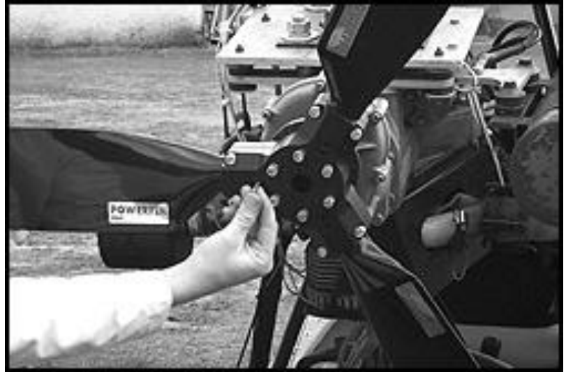
Figure 8: If the blades do not have the embedded 3/16" pin installed, then insert the 1/4" dowel pin, through the hub's "window" and in the hole of the blade's root.

If using the dowel pins to set the pitch and the blades do not have the embedded 3/16" pin installed, and then place the 1/4" x 2.5" steel dowel pin into the hole in the root of the blade. (This hole should be visible in the "blade window" on the hub.) Make sure it goes in at least 1/2". It doesn't matter how far you push it in past 1/2" as long as you don't push it in so far that you can't get it out with your fingers again.