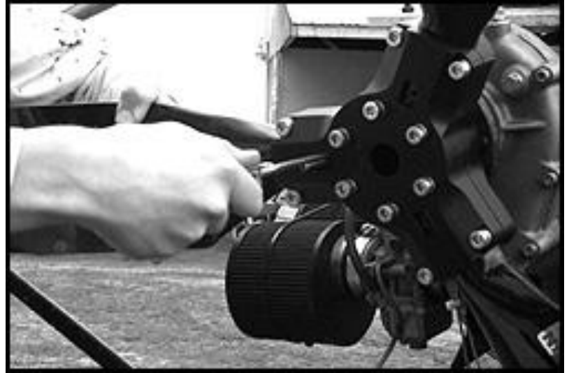
Figure 10: To use our Speed Set window & pin, place the feeler gauges in the gap between the pin and the window's edge. As long as you are consistent, you can use either side of the pin to set the feelers. Turn the blade firmly, consistently to adjust the pitch to the feelers.

Place the feelers into the gap between the pin and the edge of the window. Make sure they are centered from side to side in the gap and that they are also parallel to the pin and perpendicular to the blade. Next, turn the blade so as to squeeze the feelers between the edge of the window and the pin.