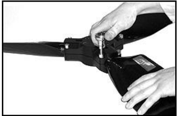
Figure 4: Insert the bolts evenly, but do NOT torque.

4. Tighten the outside (blade root) bolts down with a wrench, monitoring the gap between the hub halves to make sure the bolts go down EVENLY . This is especially critical on the two bladed propeller hubs. If one side is overly tightened down prematurely, the hub halves will not be parallel and the accuracy of the pitch setting will suffer. Generally, if you cannot see a clear difference between the gaps of the hub halves on each side of a blade, you will be accurate enough. The objective of this step is to make sure that the outside retaining bolts are down almost snug, and yet still allow for a turning movement of each blade without a lot of force.