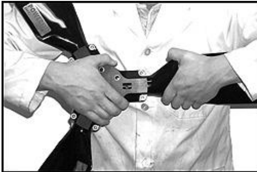
Figure 5: PULL & twist the blade with outward force to seat the blade's root against the shoulder of the hub.

5. Pick up the entire assembly and place one hand near the root of a blade and one hand on the hub. Pull and twist the blade with outward force so that the blade seats in the hub cavity all the way out as far as it can. Also make sure that the 1/4" hole (or the pin) ends up in the middle of the square window of the hub. Do this on every blade. At this point your propeller is ready to mount on your craft.