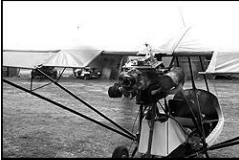
Figure 14: Time to do a run-up and see how you did.

*** ESPECIALLY WATCH YOUR EGT's on 2-cycle engines! ***