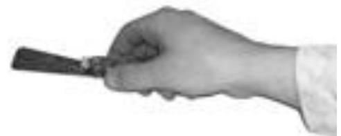
Figure 9: IF not using our Digital Protractor, combine the proper feeler gauges to make your previous setting (or about 0.095" if this is your first time).

When using the dowel pin to set the blade's pitch (with either the 1/4" dowel pin or the embedded 3/16" pin), combine the thickness of the feeler gauges to duplicate your previous setting for the current density altitude – or if you have no starting point, start with a feeler gauge amount of about 0.095". This thickness is an average to provide you with a pitch setting that is generally conducive to most applications. There will, of course, be exceptions to this setting. Without a history of feeling gauge setting for your application in your current density altitude, 0.095" will index the pitch of the blade ("in-the-ballpark") such that it comes close to proper RPM during a static run-up. The only way to be absolutely sure of the amount of pitch is to use a Propeller Protractor (and again, we can provide you with this pitching tool). A Propeller Protractor will let you know what tip pitch-angle you have for any Make or Model of Propeller blade. You can use this information when discussing pitch issues with POWERFIN or your craft manufacturer.